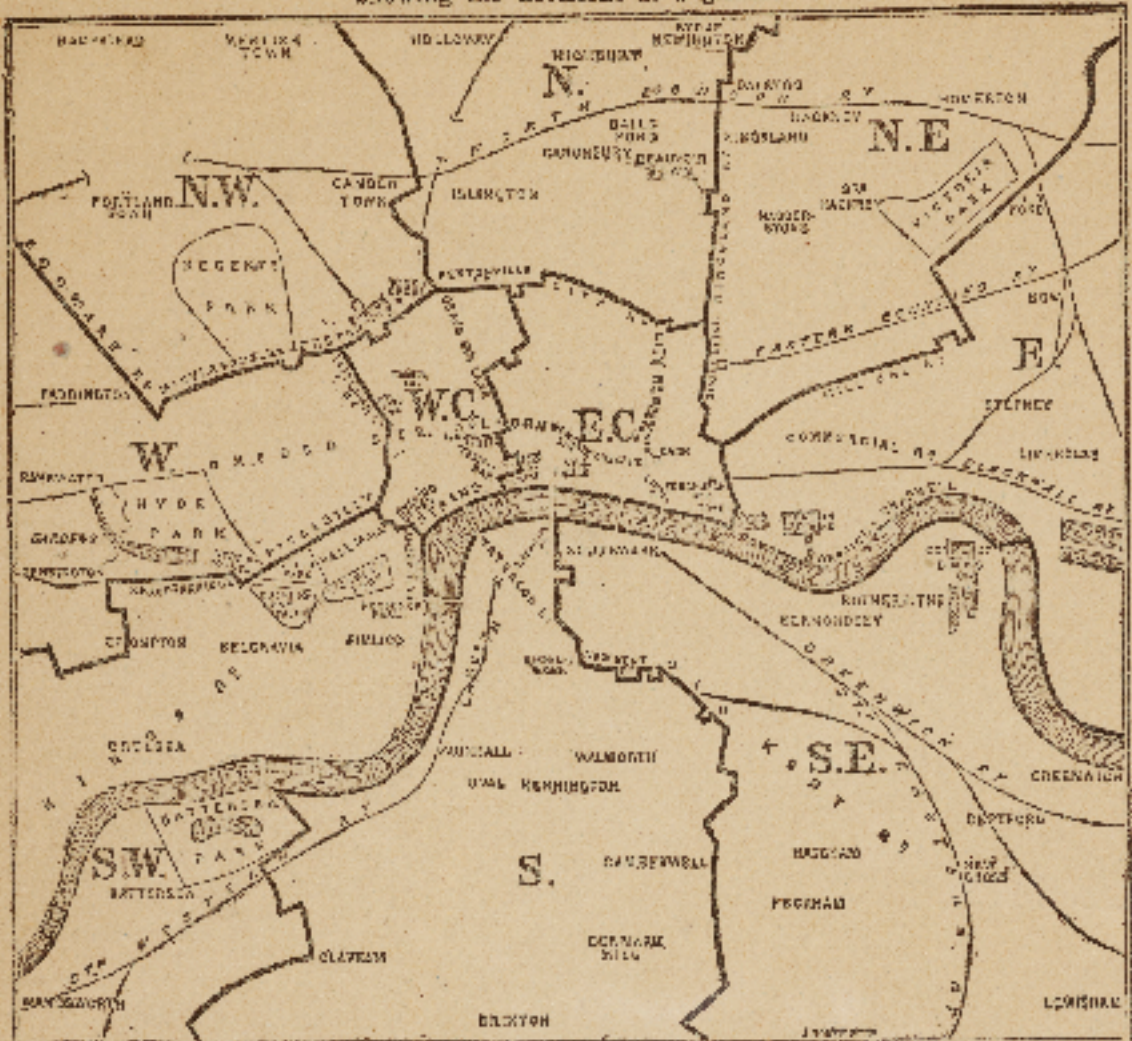
INTEREST TABLE For 250 to 25,000, 4% and 5% each, for 1 to 12 days.