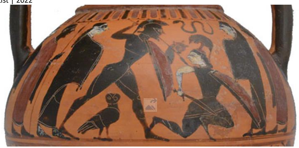
Detail from Attic or Euboean black-figure amphora (jar), ca. 570 B.C.E. Attributed to the Omaha Painter, Amazonomachy

Much of what we know about Greek painting comes from the study of Greek painted pottery. Through studying black-figure, red-figure and vases painted in other styles, scholars can learn much about Greek art and culture. This bibliography includes resources about Greek pottery in general, specific titles about black-figure and red-figure vases, and resources about Greek mythology.