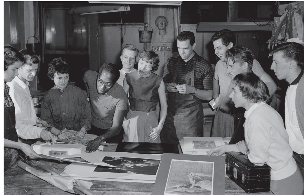
Robert Blackburn (fourth from left) and others in the workshop. June 18, 1959.

Members are the ART & SOUL of the museum. Our members provide essential support. Join at the Info Desk, Bloch Lobby.