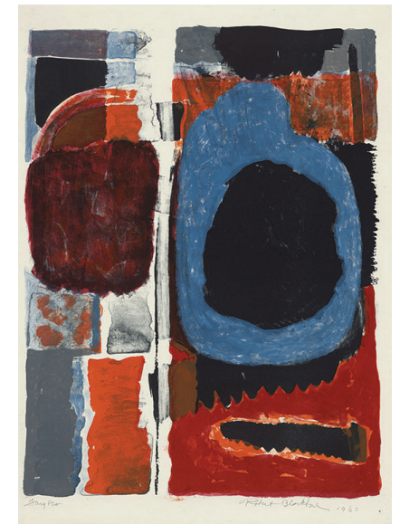
Robert Blackburn, American (1920–2003). Faux Pas (Unfinished Note) , about 1960. Color Lithograph, 22 x 16 ½ inches. Nelson/Dunks Collection.