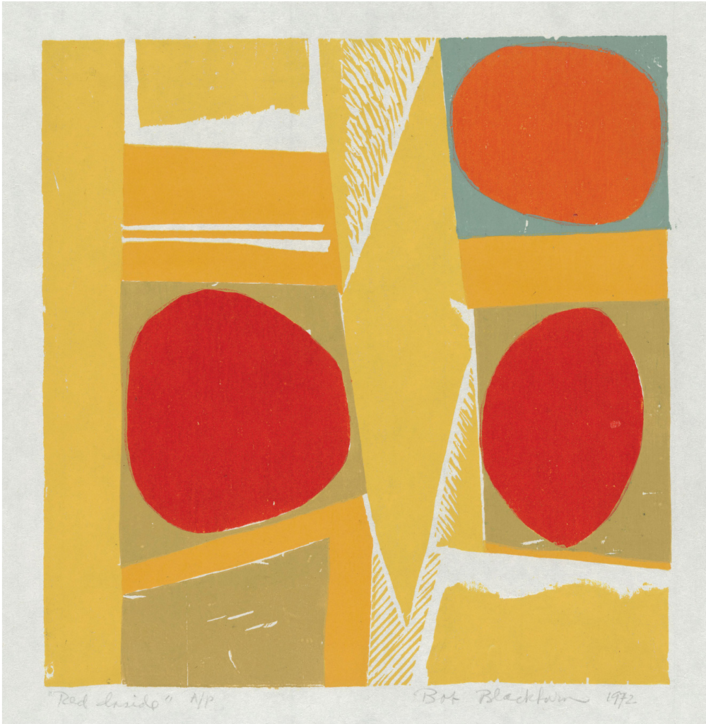
Robert Blackburn, American (1920–2003). Red Inside, 1972. Color Woodcut, 12 x 11 ½ inches. Nelson/Dunks Collection.

Robert Blackburn & Modern American Printmaking follows the trajectory of Blackburn's career. The exhibition traces his artistic evolution in the context of the creative community with whom he engaged throughout his life.