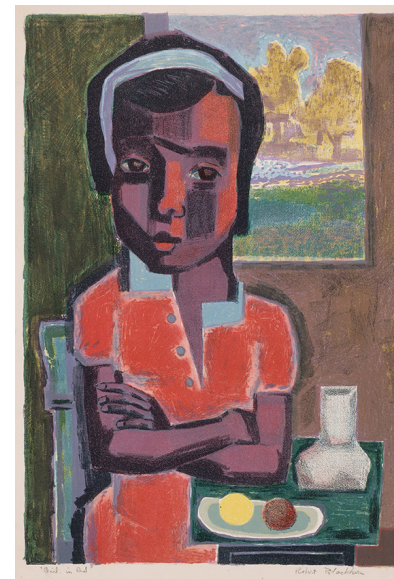
Robert Blackburn, American (1920–2003). Girl in Red , 1950. Color lithograph, 18 ¼ x 12 ½ inches. The Petrucci Family Foundation Collection of African American Art.