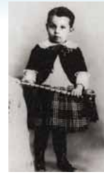
Thomas Hart Benton (April 15, 1889–Jan. 19, 1975) Benton (left) shown at age three in 1892. He was named after his great, great uncle, Missouri's first U.S. Senator.