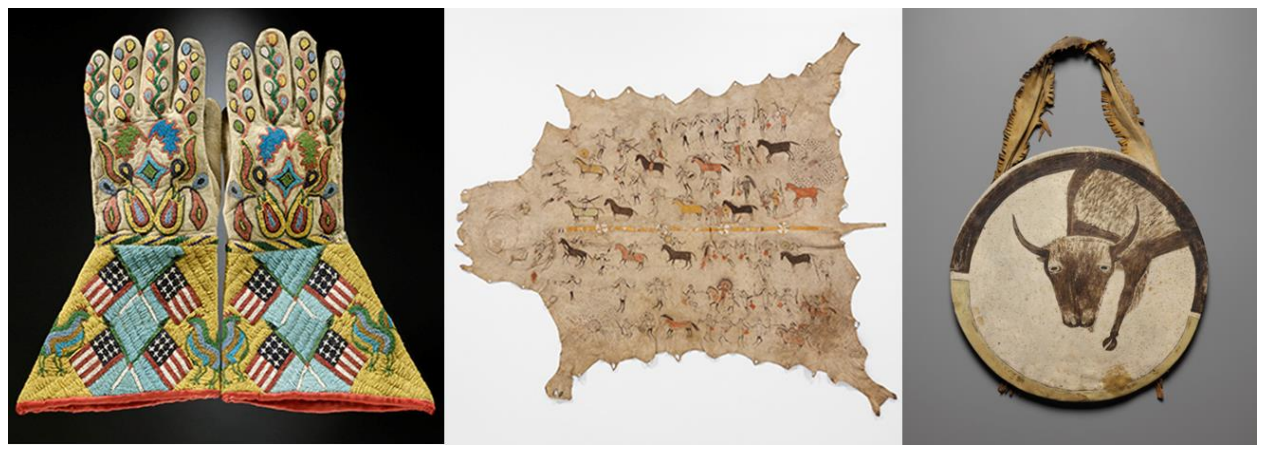
Gauntlets, Metis-Sioux, AIJ18F Hirschfield Collection