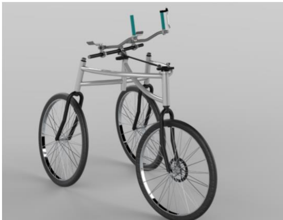
Afari mobility aid, 2010-14