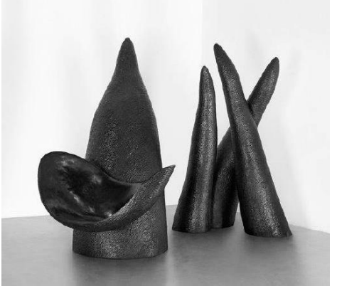
Dante's Heaven, 2015 by Wendell Castle