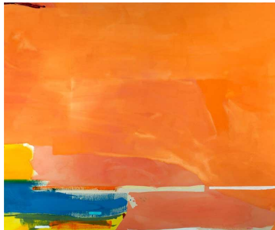
Elberta, 1975 Helen Frankenthaler