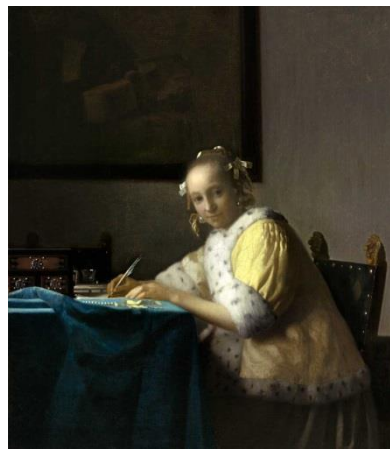
A Lady Writing , about 1665 Johannes Vermeer

The seventeenth century in the Netherlands is known as the Golden Age of Dutch art. In the exhibition, Reflecting Class in the Age of Rembrandt and Vermeer , differences between the social classes are examined through their depiction in Dutch art. In this bibliography, created in conjunction with the exhibition, we have included books on Dutch art and society, general titles on Dutch seventeenth century painting, titles exploring individual artists' contributions, as well as works about Dutch decorative arts. All of the items on the bibliography are in the collection of the Spencer Art Reference Library, unless otherwise noted.