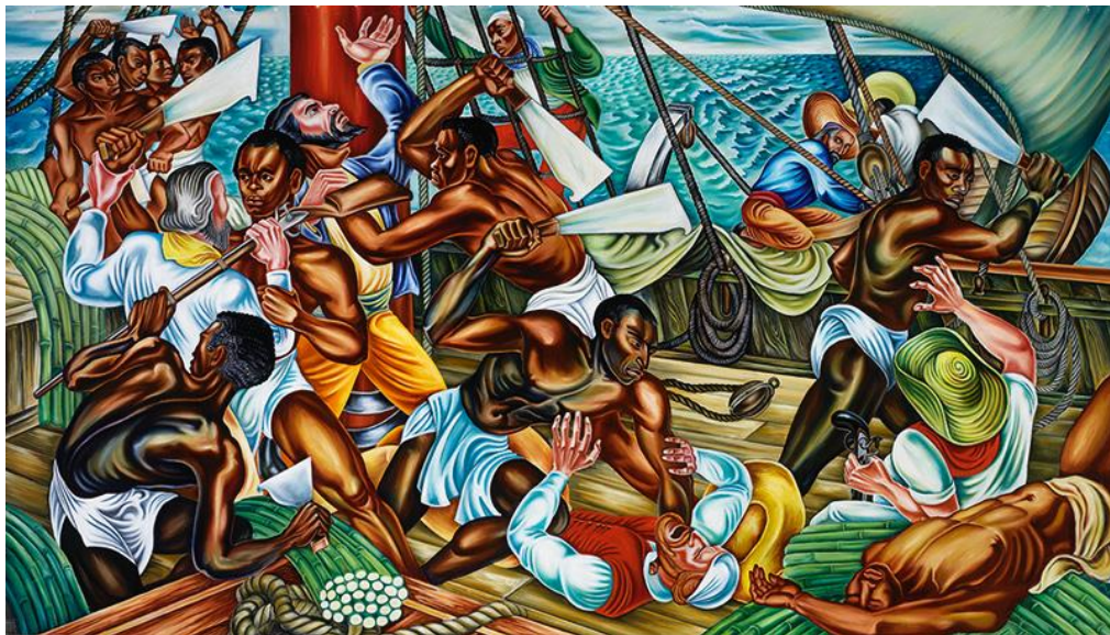
The Mutiny on the Amistad, 1939

Hale Woodruff was an African-American artist and muralist. He is most well-known for his mural series at Savery Library at Talladega College, which he painted between 1939 and 1942. In this bibliography, we have included a selection of books about Woodruff, African-American Art, and titles on American mural painting in general. The items are in the collection of the Spencer Art Reference Library, unless otherwise noted.