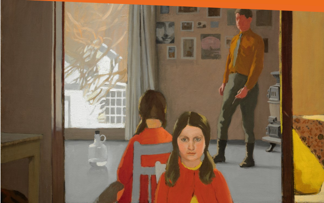
Fairfield Porter, American (1907–1975). The Mirror (detail), 1966. Oil on canvas. Gift of the Enid and Crosby Kemper Foundation, F86-25.